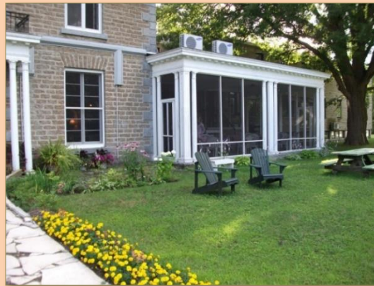
ENJOY MEALS IN SCREENED PORCH