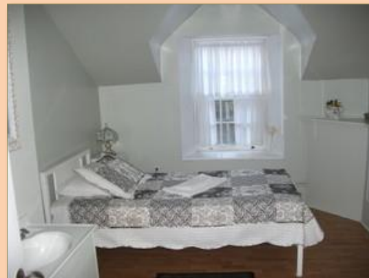
PRIVATE ROOMS WITH SINK