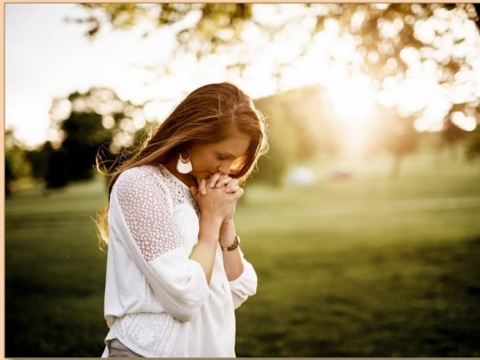
PAUSE AWHILE AND KNOW THAT I AM GOD. Psalm 46:10