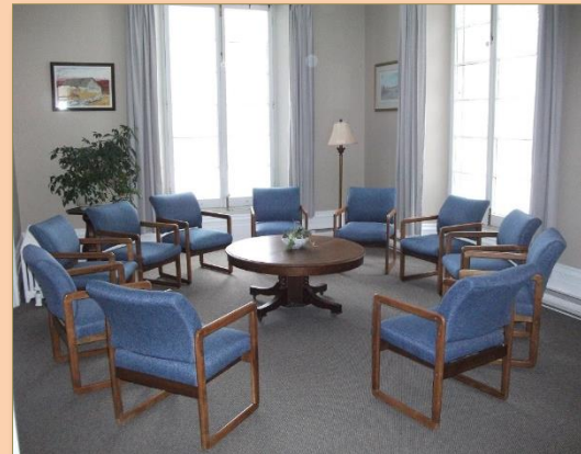
COMMUNAL CONTEMPLATIVE PRAYER