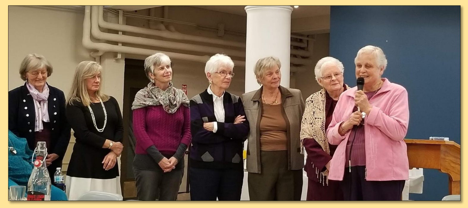
Six of the seventeen artists featured in WORDS FOR LIFE