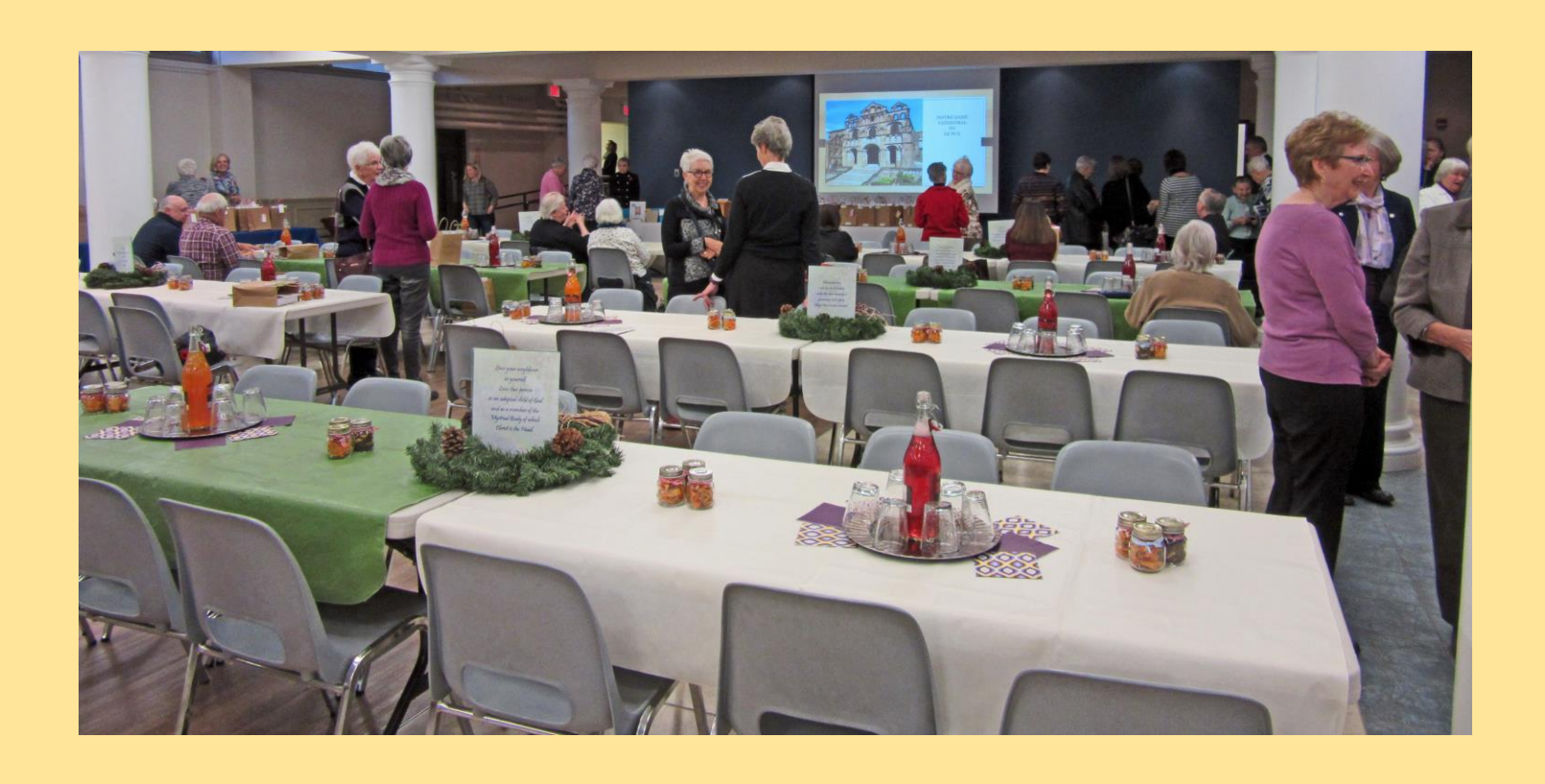
Guests visiting and sharing stories