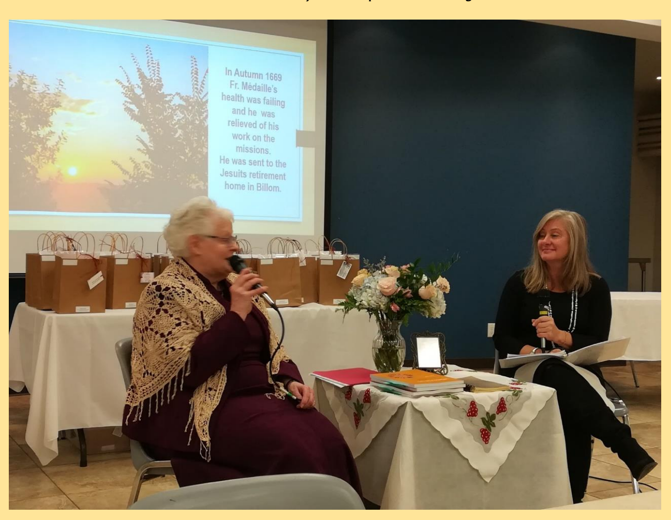
Obey the inspiration of grace... when IT comes to you ... follow it with great gentleness and courage.