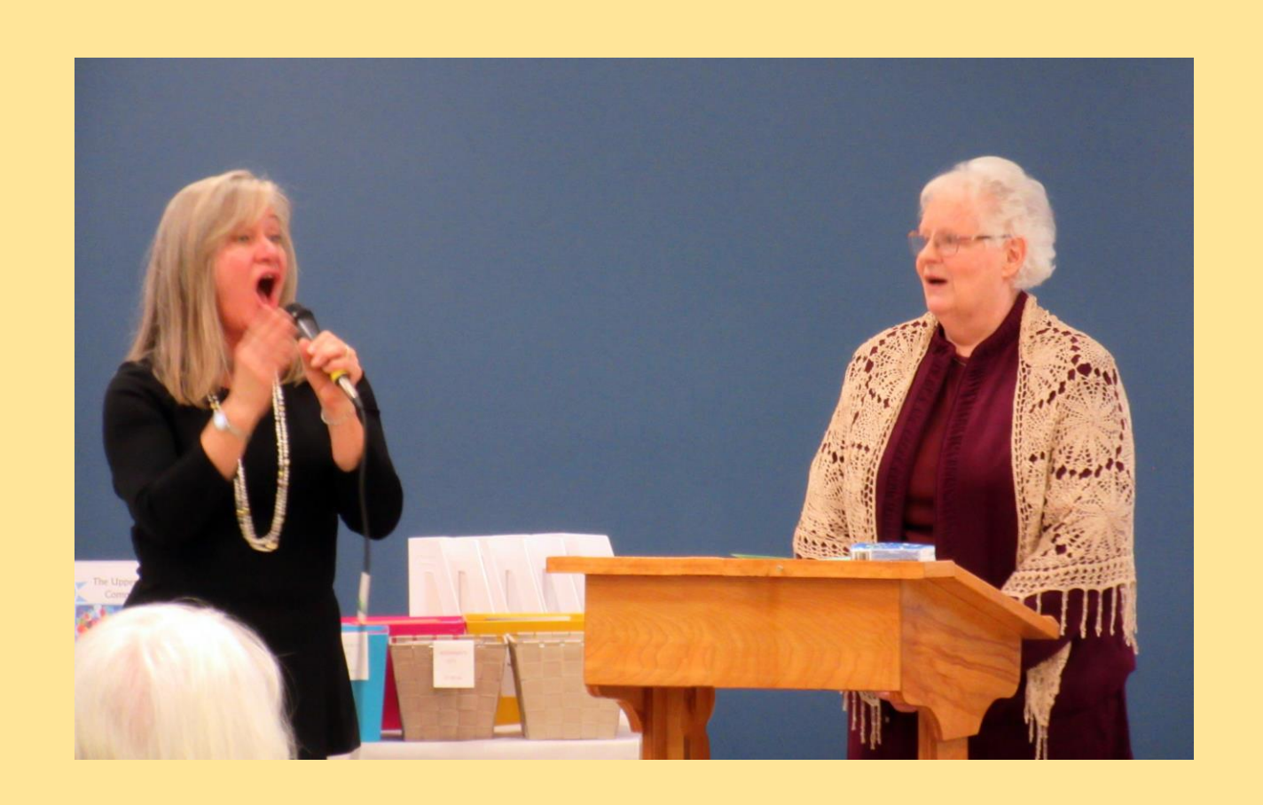
Singing ALLELUIA ... ALLELUIA... ALLELUIA!