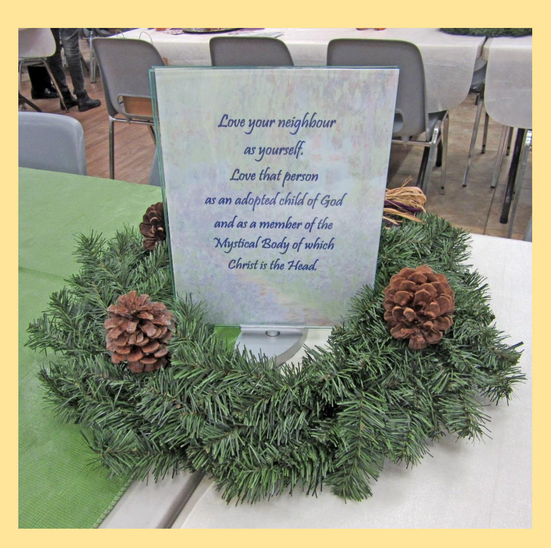
Table centerpieces ... with quotes from the writings of Father Medaille, S.J.